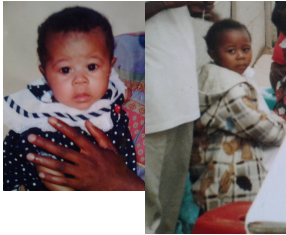
Closest Celebrity Match: Minnie Dlamini