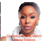
Closest Celebrity Match: Minnie Dlamini